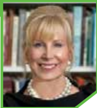
Annette Scott , First Lady of Florida

As First Lady of Florida, Mrs. Ann Scott focuses on traveling the state, sharing her passion for reading and literacy with Florida's students. An avid reader herself, the First Lady believes that early learning builds a foundation for lifelong learning. In addition to promoting the importance of literacy, First Lady Scott spends time with foster children and supports healthy lifestyles for children and families. A military wife, daughter, and sister, she visits bases around the state and takes time to thank our service men and women for the sacrifices they make for our country. Together, Governor and First Lady Scott have two daughters and four young grandsons. Throughout their lives, the Scotts have been committed to helping their community both locally and around the world. The First Lady received her degree in business administration from Southern Methodist University in Dallas, Texas. She and Governor Scott are proud to be the founding sponsors of the George Washington University's New Venture Competition.