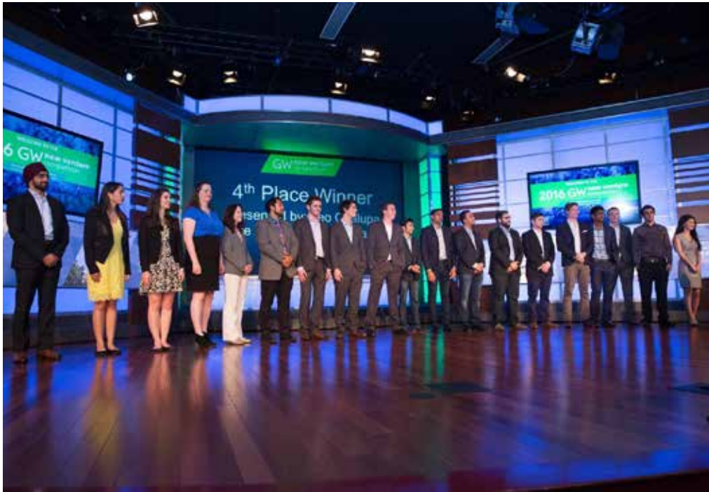
The 8th Annual GW New Venture Competition Finals were held on April 19, 2016, in the Jack Morton Auditorium at the GW School of Media and Public Affairs.