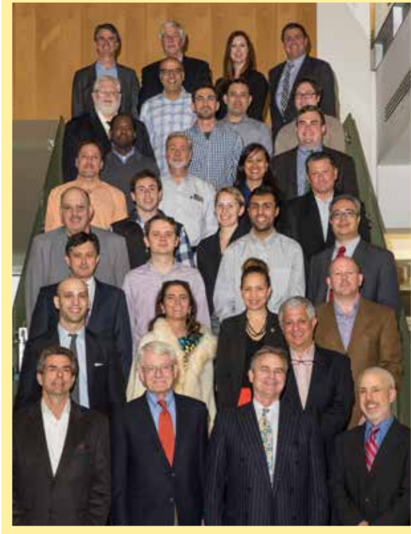
(All rows listed left to right)